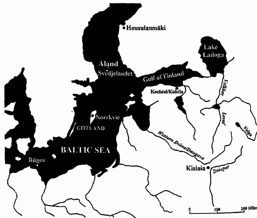
MAP 2: TPQ 837/38 DIRHAM HOARDS IN THE BALTIC REGION WITH "SPECIAL ISSUE" KHAZAR COINS

continental Baltic-Eastern dirham trade. All three of these hoards were the earliest deposits of dirhams in these lands, and all contained Khazar coins. These observations lead to the conclusion that the Khazar production of dirhams notably contributed to the development of trade in the Baltic. It is also clear that these Khazar dirhams were carried at lightning speed from their place of emission to entirely new commercial areas of northern Europe where they opened up novel commercial opportunities, which in turn brought many more dirhams in the following decades and centuries into the Baltic.