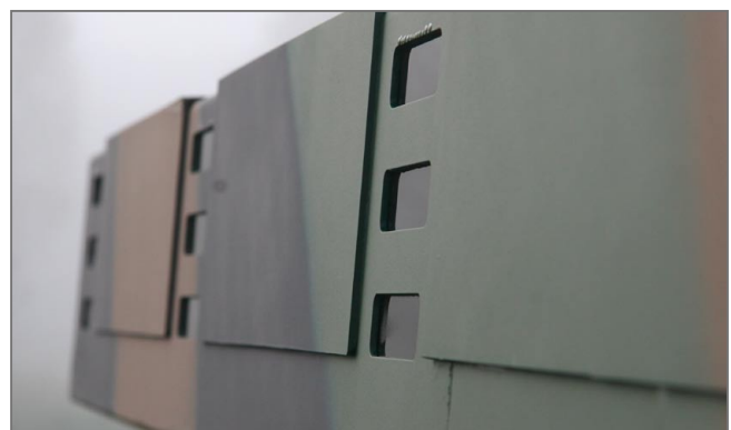
Sensors and Countermeasures of AMAP-ADS

In order to provide reliable protection against dive-attack threats, AMAP-ADS is the recommended solution. Due to the enormously high penetration capability of such weapon systems, the required areal density of the armour would be excessive. AMAP-ADS provides efficient protection even against dive-attack threats – at weights of only 145 - 500 kg depending on vehicle type.